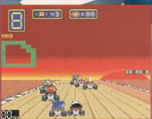
Eight wacky animals, each with unique colorful antics.