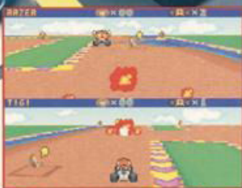
Teunt opponents during multiplay with Famrats/Poltrails™