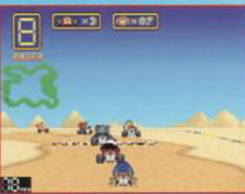
High-speed, vivid 3-D graphics.

“Wacky Wheels is one of the best shareware releases we’ve ever seen. You’ll love it.”