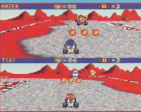
Comm-bat™ zones are a blast for head-to-head play with a friend.